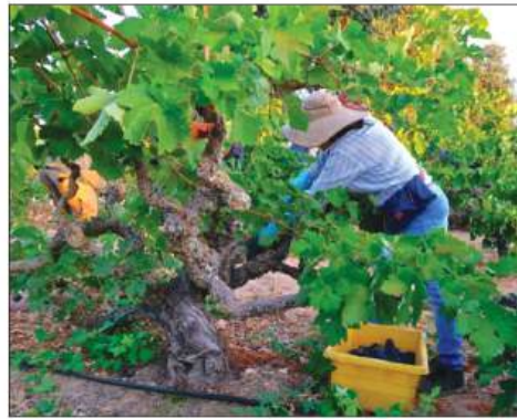
2019 Royal Tee Vineyard harvest.

2018 Marchelle, Jessie's Grove Vineyard Mokelumne River (Lodi) Zinfandel ($34) - As with all great vineyards, sensory profiles reflecting terroir can be found in each vintage, but Mother Nature usually puts her own stamp on wines from each vintage. Typical of what we've found in other 2018 Lodi-grown Zinfandels, the Marchelle's 2018 Jessie's Grove Vineyard Zinfandel is a little meatier, a little more strongly spice toned, and comes across as rounder and more velvety in texture, compared to the softer, fruit-forward, light and silky qualities of the 2018s by both Matthiasson and Marchelle. Wine geeks would consider the 2018 to be a more "serious" style (and 2019s, "friendlier," "drink sooner" wines), if only because they love the prospect of bottle aging wines and waiting for more characteristics to be unveiled over time.