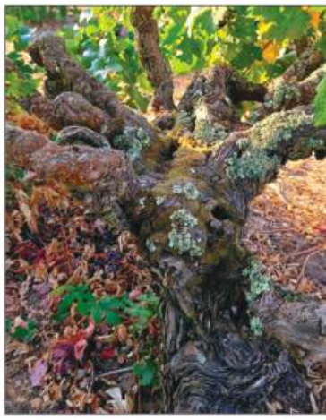
Classic "head" trained Zinfandel in Lodi's Royal Tee Vineyard, planted 132 years ago.