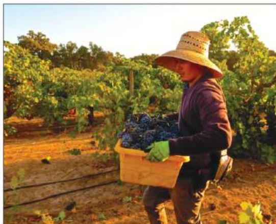
Lug of Zinfandel grapes during the 2019 Royal Tee Vineyard Zinfandel harvest.