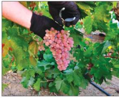
Flame Tokay cluster picked during the 2019 Royal Tee Vineyard harvest — one of the components that help make these field mix Zinfandels so floral and feminine.

2018 Marchelle, Jessie's Grove Vineyard Mokelumne River (Lodi) Zinfandel ($34) - As with all great vineyards, sensory profiles reflecting terroir can be found in each vintage, but Mother Nature usually puts her own stamp on wines from each vintage. Typical of what we've found in other 2018 Lodi-grown Zinfandels, the Marchelle's 2018 Jessie's Grove Vineyard Zinfandel is a little meatier, a little more strongly spice toned, and comes across as rounder and more velvety in texture, compared to the softer, fruit-forward, light and silky qualities of the 2018s by both Matthiasson and Marchelle. Wine geeks would consider the 2018 to be a more "serious" style (and 2019s, "friendlier," "drink sooner" wines), if only because they love the prospect of bottle aging wines and waiting for more characteristics to be unveiled over time.