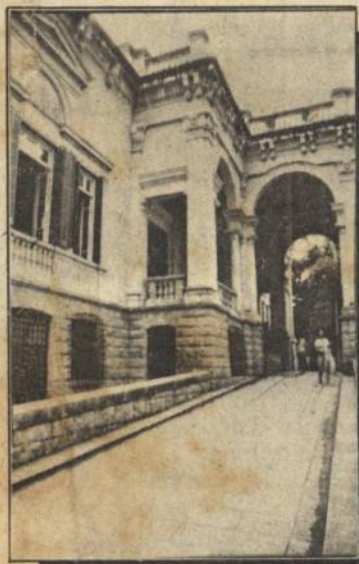
A 19th century mansion located in exceptional surroundings is the setting for Rio's largest and most interesting "free" arts school.