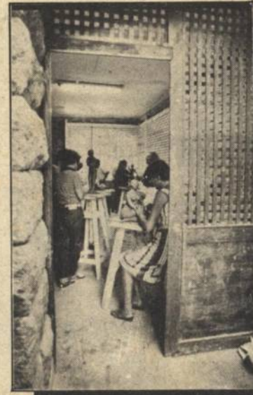
Numerous work shops function from early in the morning until late at night at one of Rio's most interesting arts institutions.

are bright, airy and full of artistic bric-a-brac. The students range from Bohemian-looking teenagers in paint-stained jeans to middle-aged women enjoying the open-air tapestry class offered by noted French tapestry artist Françoise Galle.