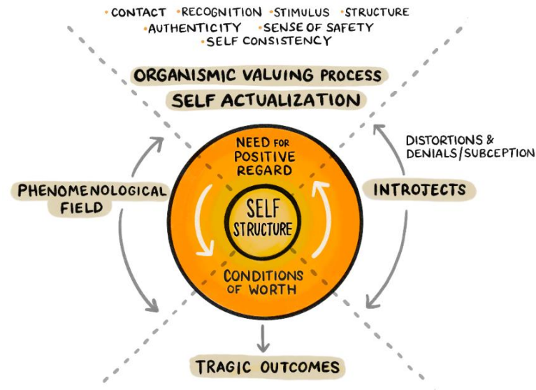
Figure 4, based on drawing by the author. A person-centered, neurodivergent needs model.

In closing, I encourage readers to engage more deeply and reflexively in their being-with neurodivergent people. Doing so for any interaction, not just that which could be therapeutic, could leave them empowered and better equipped to deal with life's challenges. Psychotherapy cannot, on its own, fix the ills of wider society—but, as a power-wielding institution, it can be familiar with and acknowledge them, and even work from within to change the ways in which they are experienced by individuals. Indeed, failure to do so makes psychotherapists complicit in harming not just neurodivergent, but all, people who seek mental health support.