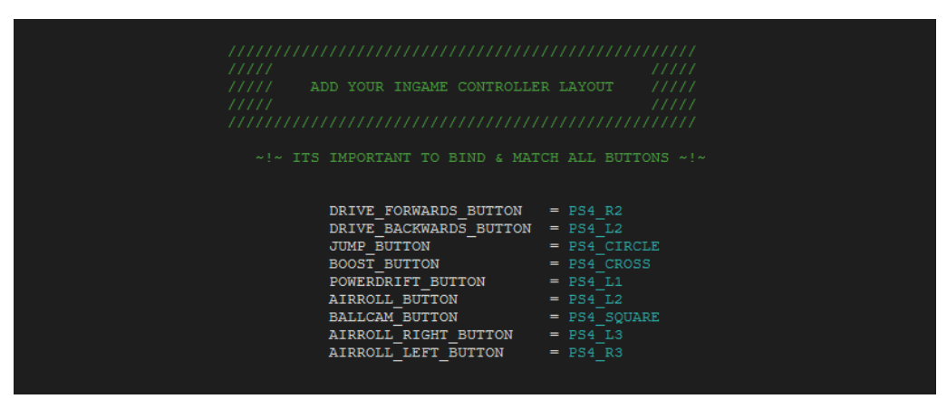
SCRIPT Game Layout Customization

Certain game default settings can interfere with the script. Such as the training functions to reset the ball. Unbind these buttons .